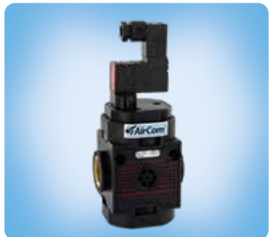
S052 electric switch-on valve