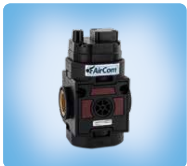
A052 soft start valve